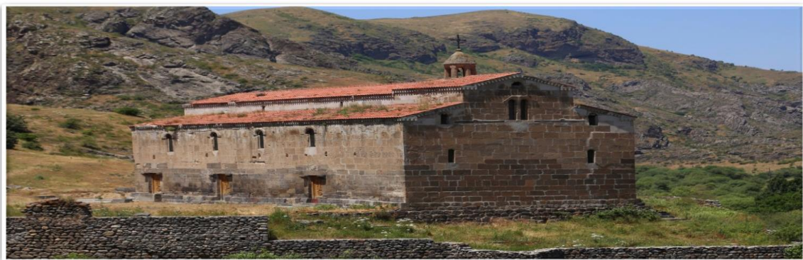
V-VI centuries (VI-VII centuries). Lachin.

Although most of the architectural pearls located in different regions of Azerbaijan have come down to our time, those related to Karabakh have been subjected to noticeable destruction from time to time, especially in the last thirty years, as a result of Armenian aggression, and many of them have been appropriated by them. Among them, there are Christian-type religious architectural monuments from the period of ancient Caucasian Albania and the Early Middle Ages. Of course, since these buildings are directly related to the local people living here due to their shape, masonry technology and aesthetic capacity, it is impossible to hide their real address. On the other hand, the fact that the Armenians, who erected a monument in Agareh district in honor of the 150th anniversary of their relocation from Iran to Karabakh in 1978, is only regrettable and laughable Agoglan temple.