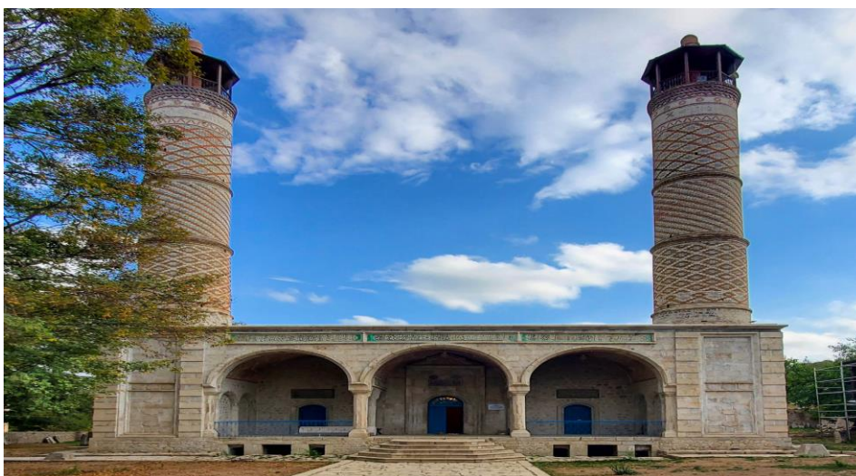
Yukhari Govhar Agha Mosque

The main northern facade part of the Ashagi Govhar Agha Mosque, the second Juma Mosque built on the basis of similar architecture-planning principles of Shusha city, is designed with three arched arcaded porches.